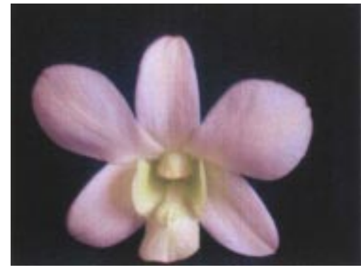
Fig. 2. Flower of D. "Emma White" (Female parent)

Fig. 1. Flower of NRCO-42 ( D. "Emma White" x D. "Pampadour")