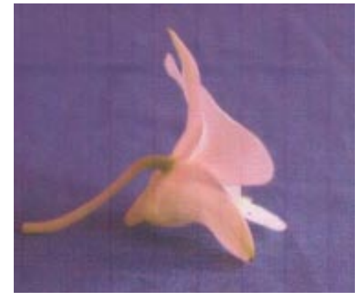
Fig. 6. Mentum shape of D. "Emma White"