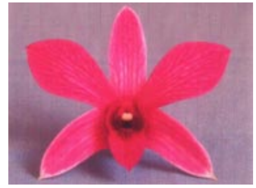
Fig. 4. Flower of D. "A. Abraham" (Standard check)