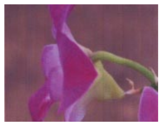
Fig. 7. Mentum shape of D. "Pampadour"