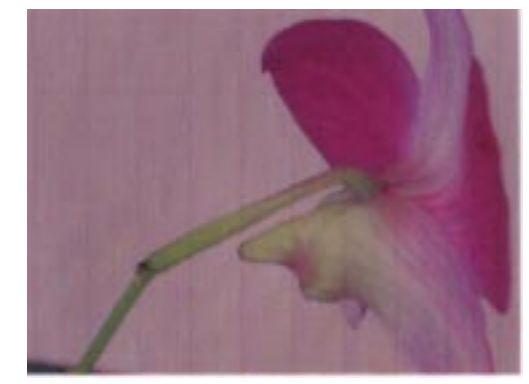
Fig. 8. Mentum shape of D. "A. Abraham"

www.IndianJournals.com Members Copy, Not for Commercial Sale Downloaded From IP - 61.247.228.217 on dated 27-Jun-2017