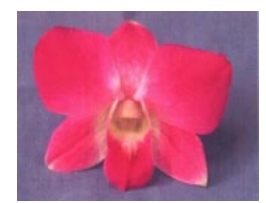
Fig. 1. Flower of NRCO-42 ( D. "Emma White" x D. "Pampadour")