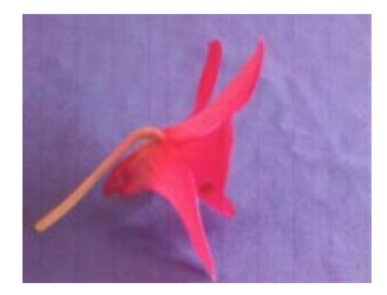
Fig. 5. Mentum shape of NRCO-42