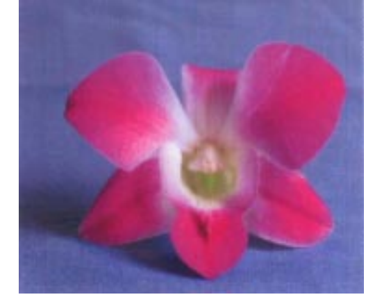
Fig. 3. Flower of D. "Pampadour" (Male parent)