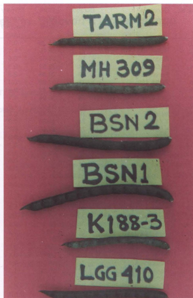
Fig. 3. Pods of six genotypes of mungbean