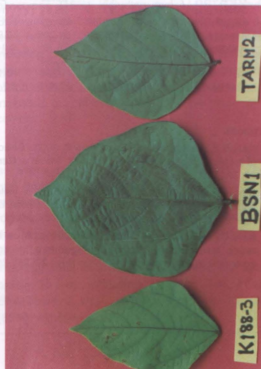
Fig. 4. Terminal leaflets of three genotypes of mungbean