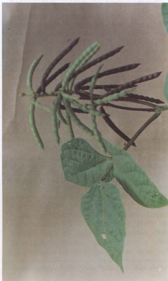
Fig. 1. A plant of BSN1, a promising line selected from the land race, Nagpuri local