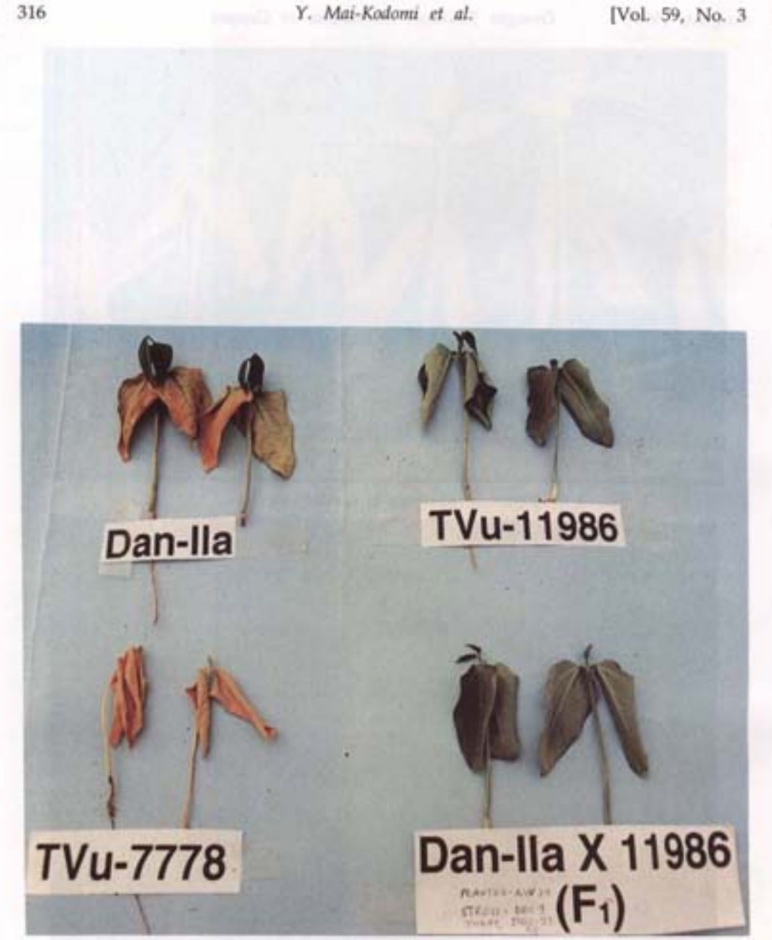
Fig. 1. Two types of drought tolerance in cowpea. 'Type 1' TVu 11986; 'Type 2' Dan Ila, and TVu 7778 = susceptible. The F1 plant between the two types shows dominance of Type 1.