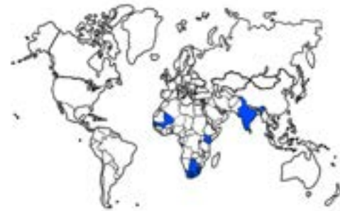
Fig. 2. Geographical distribution of partial restorers and restorers on maldandi cytoplasm