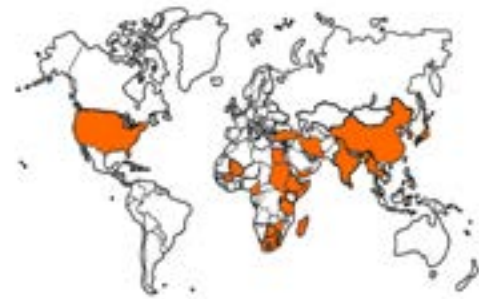
Fig. 3. Geographical distribution of maintainers on maldandi cytoplasm

restoration on different breeding lines (Pande et al. 1990). Similarly, in rice the interplay between the nuclear genes of the CMS lines and the restorer genes of male parents could explain the variable fertility pattern of breeding lines when crossed with the same WA-CMS line source (Viraktamath 2010). So, based on previous works of literature and present findings it could be concluded that the nuclear background of ms line influences the expression of restoration and seed setting. It could also be stated that additional minor genes and environmental factors (rainfall and humidity) affected fertility restoration and led to gradation in the restoration in addition to major genes (Kariyannanavar et al. 2023). The genotypes IS 29269 (86.65%), IS 26046 (61.20%), IS 5919 (35.47%) and IS 26025 (33.45%) have been grouped as partial restorers because of partial seed setting. This partial seed setting may depend upon the strength of minor genes governing restoration. Promising restorers can be obtained by inducing these minor genes into the identified restorer. This will ensure the stability of the restorers by reducing the environmental influences.