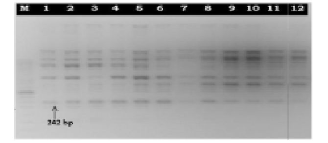
Fig. 1. The specific band of 242bp obtained in susceptible genotypes only by using RAPD primer OPA-5